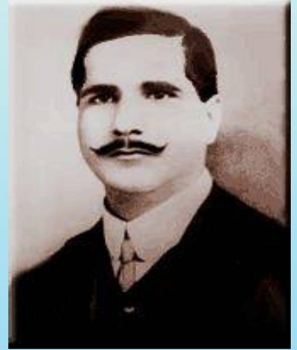
Dr. Muhammad Iqbal

یہ علم و حکمت کی مہرہ بازی، یہ بحث و تکرار کی نمائش نہیں ہے دنیا کو اب گوارا پرانے افکار کی نمائش